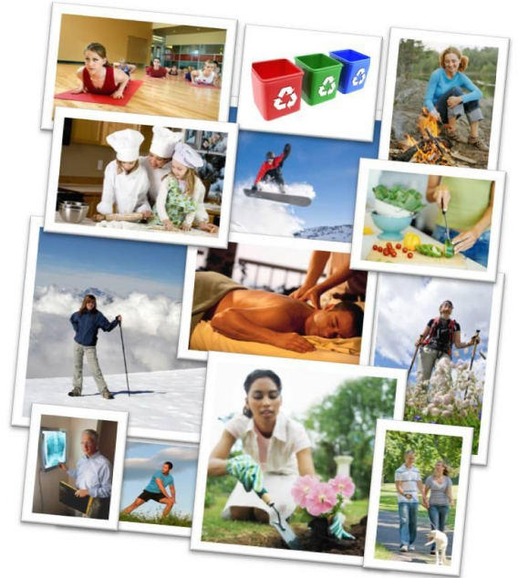
Exhibit in The Healthy Living Expo! Meet THOUSANDS of consumers in ONE Day!!!